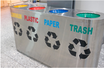
Individual bins for the disposal of PPE , food and disposable plates and cutlery should be provided by the exhibitor on their stands