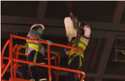
Air change rate in the halls is 8 times per hour. Air extraction in the halls is pre-scheduled and all hall shutter doors will be kept open both before and after the event to assist with air circulation