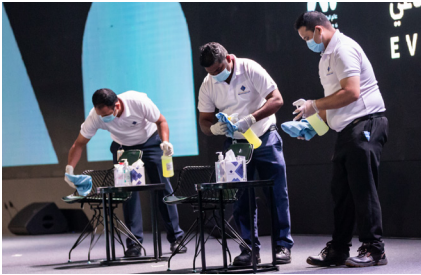
Disinfection protocols are adhered to in all public areas, F&B outlets and restrooms