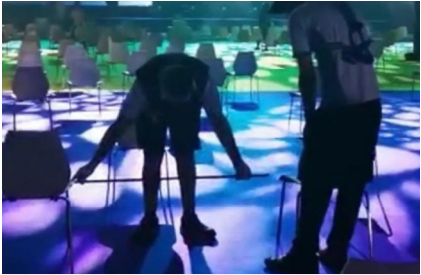
Conference chairs are set 2 metres apart from each other at the conference