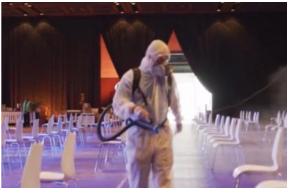
Conference chairs are protected with an antimicrobial shield and are sanitised regularly