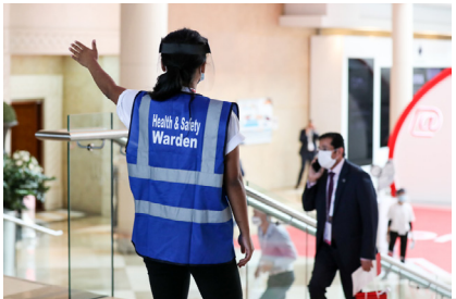
Trained safety wardens to monitor social distancing & wearing of masks throughout the event